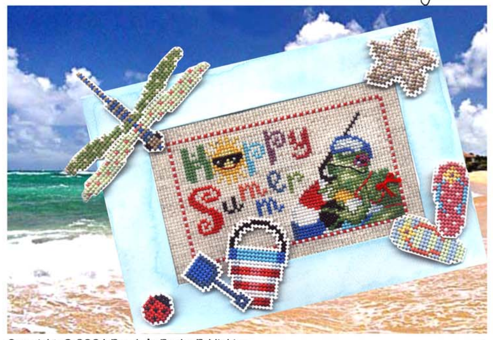
Copyright @ 2004 Brooke's Books Publishing

This design may be reproduced for newsletter or handout but may not be kitted or sold.