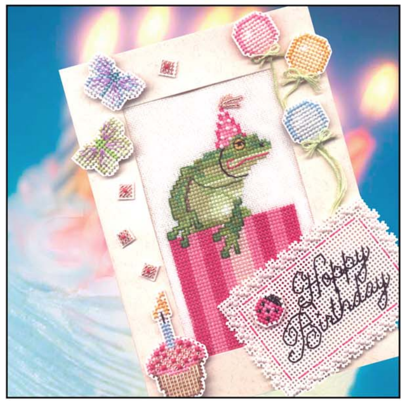
Copyright @ 2005 Brooke's Books Publishing

This design may be reproduced for newsletter or handout but may not be kitted or sold.